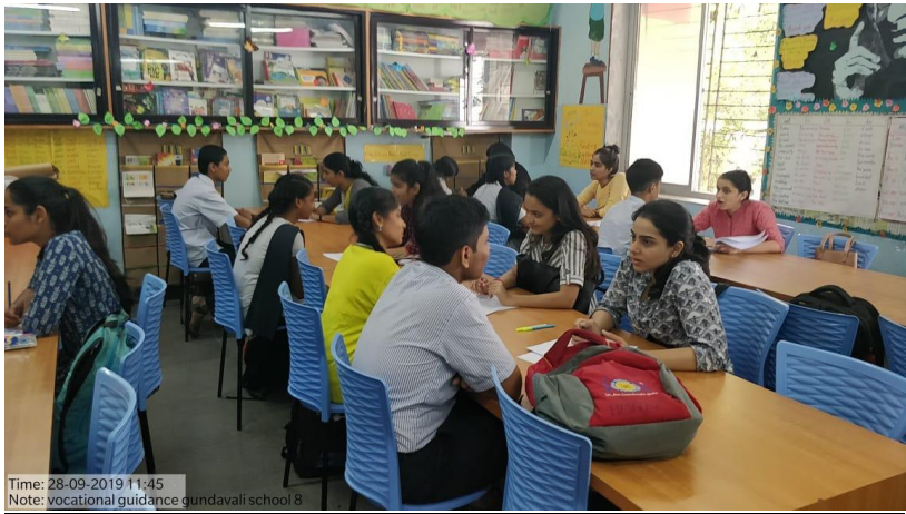
Time: 28-09-2019 11:45 Note: vocational guidance gundavali school 8